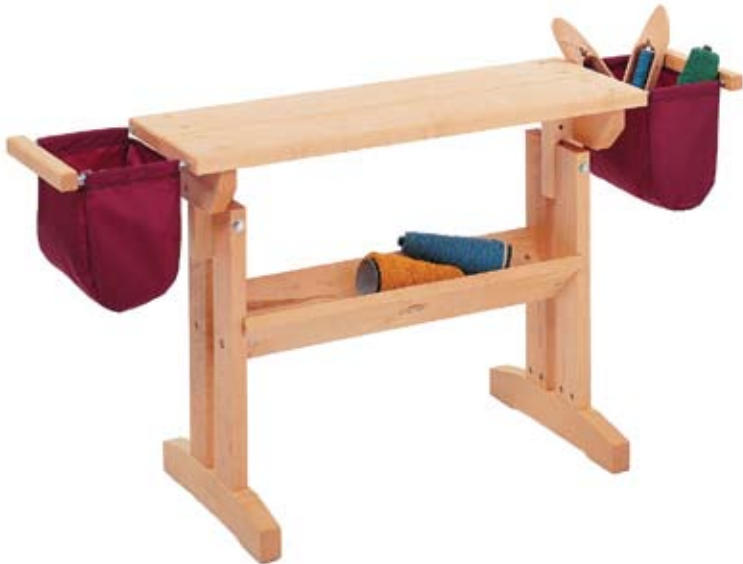
(Loom Bench Shown with Optional Bench Bags)