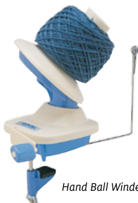
Hand Ball Winder