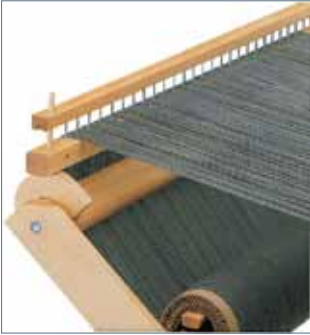
Wolf Loom Raddle