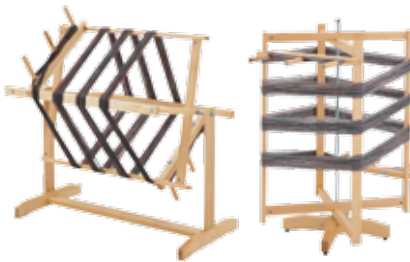
Horizontal and Vertical Warping Mills