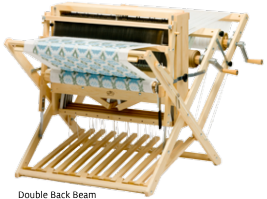
Double Back Beam (shown on 8 shaft Baby Wolf)